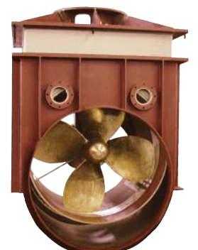
Detachable thruster for servicing without docking.