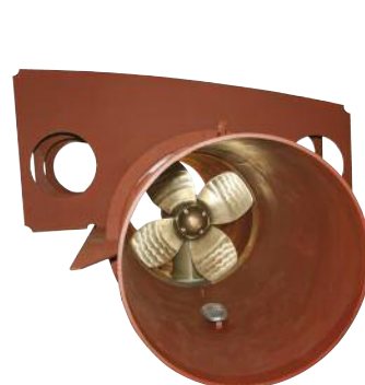
Customised tunnel with ready-made frame sections.